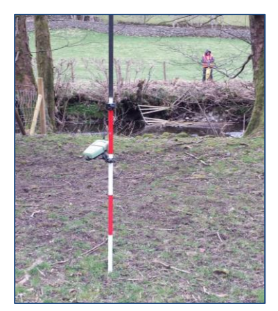
GPS pole, topographical survey equipment

Once we have a robust flood model and have a concept scheme design, we will instruct a number of surveys to be carried out on key structures e.g. walls and bridges to identify the structural integrity of existing infrastructure which may form part of, or be impacted by our proposals. It's likely this will take place in Spring 2022 but we will keep you updated.